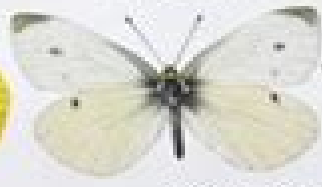
14. Small White Pieris rapae