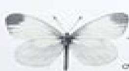
10/11. Wood White Leptidea sinapis