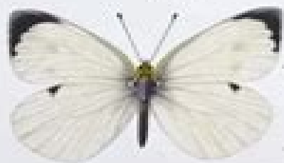
13. Large White Pieris brassicae