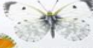
12. Orange-tip Anthocharis cardamines