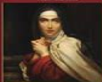
Volume Six October + November The Original 1885 Edition