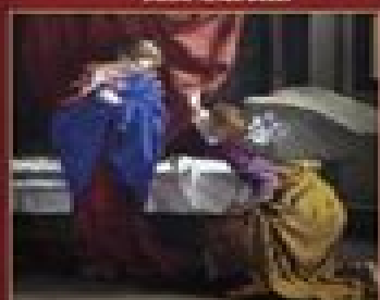
Volume Two February + March The Original 1885 Edition