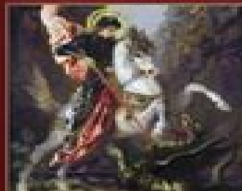
Volume Three April + May The Original 1885 Edition