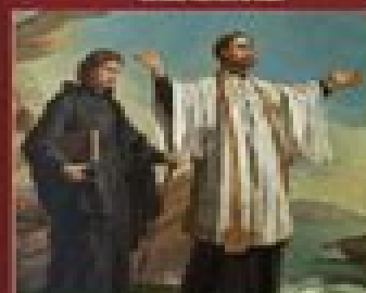
Volume Seven December + Appendixes The Original 1885 Edition