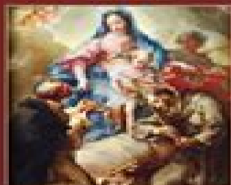
Volume Five August + September The Original 1885 Edition