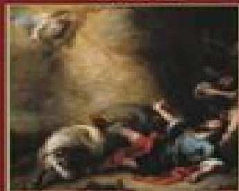
Volume One Introductory Prayers + January The Original 1885 Edition