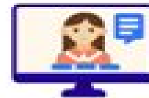
Virtual mental health coaching