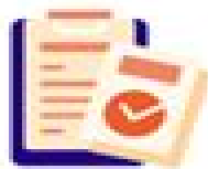
Employee Assistance Programs (EAPs)