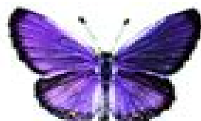
Great Purple Hairstreak