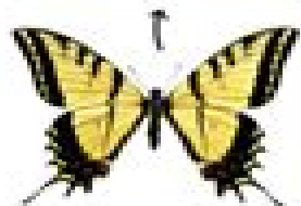
Eastern tiger Swallowtail