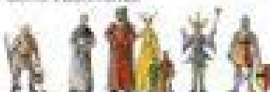
Knight Priest Noble Peasant Soldier Farmer