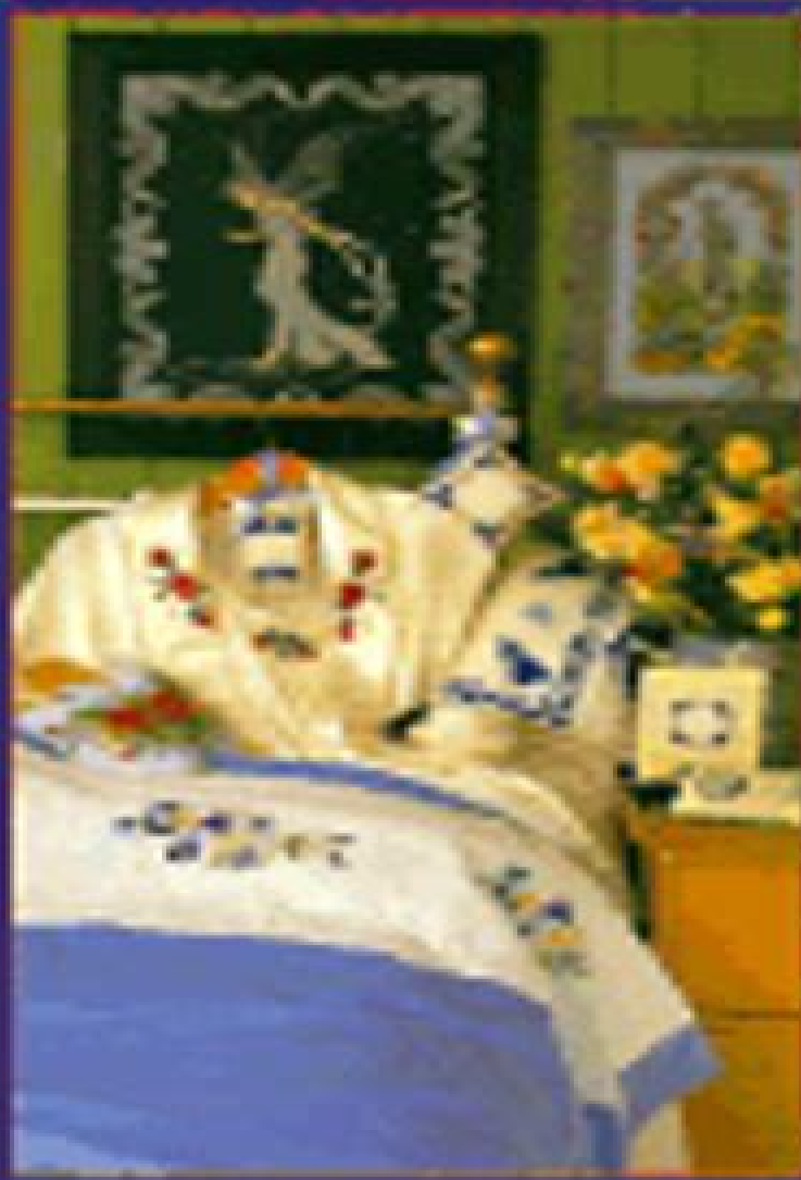
Lindsey Fox - Heather Spruce