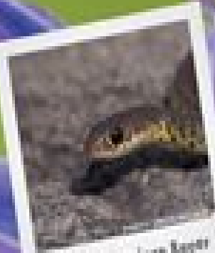
North American Racer