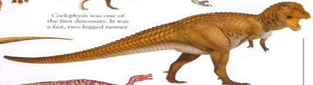
Tyrannosaurus rex was a giant dinosaur, as tall as a small house