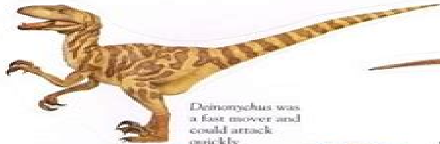
Deinonychus was a fast mover and could attack quickly