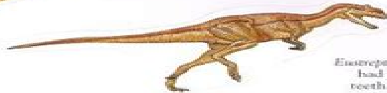
Eustrepsospondylus had very sharp teeth for slicing through flesh