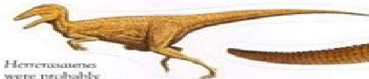
Herrerasaurus were probably alive as much as 230 million years ago