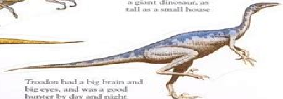
Troodon had a big brain and big eyes, and was a good hunter by day and night