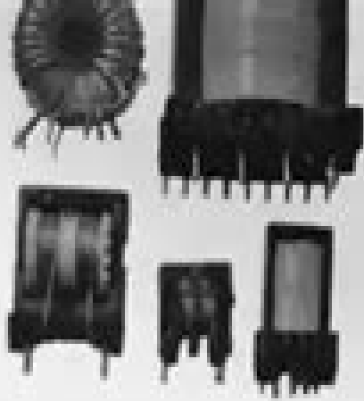
Inductors & Transformers