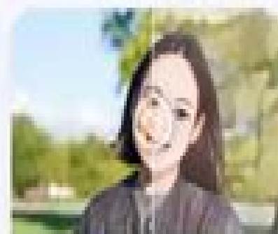
Image To Anime

https://imageupscaler.com/image-to-anime/