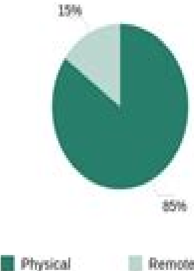
Remote vs. In-Person

85% of Bilingual Work Home Job Openings in the United States are Physical positions.