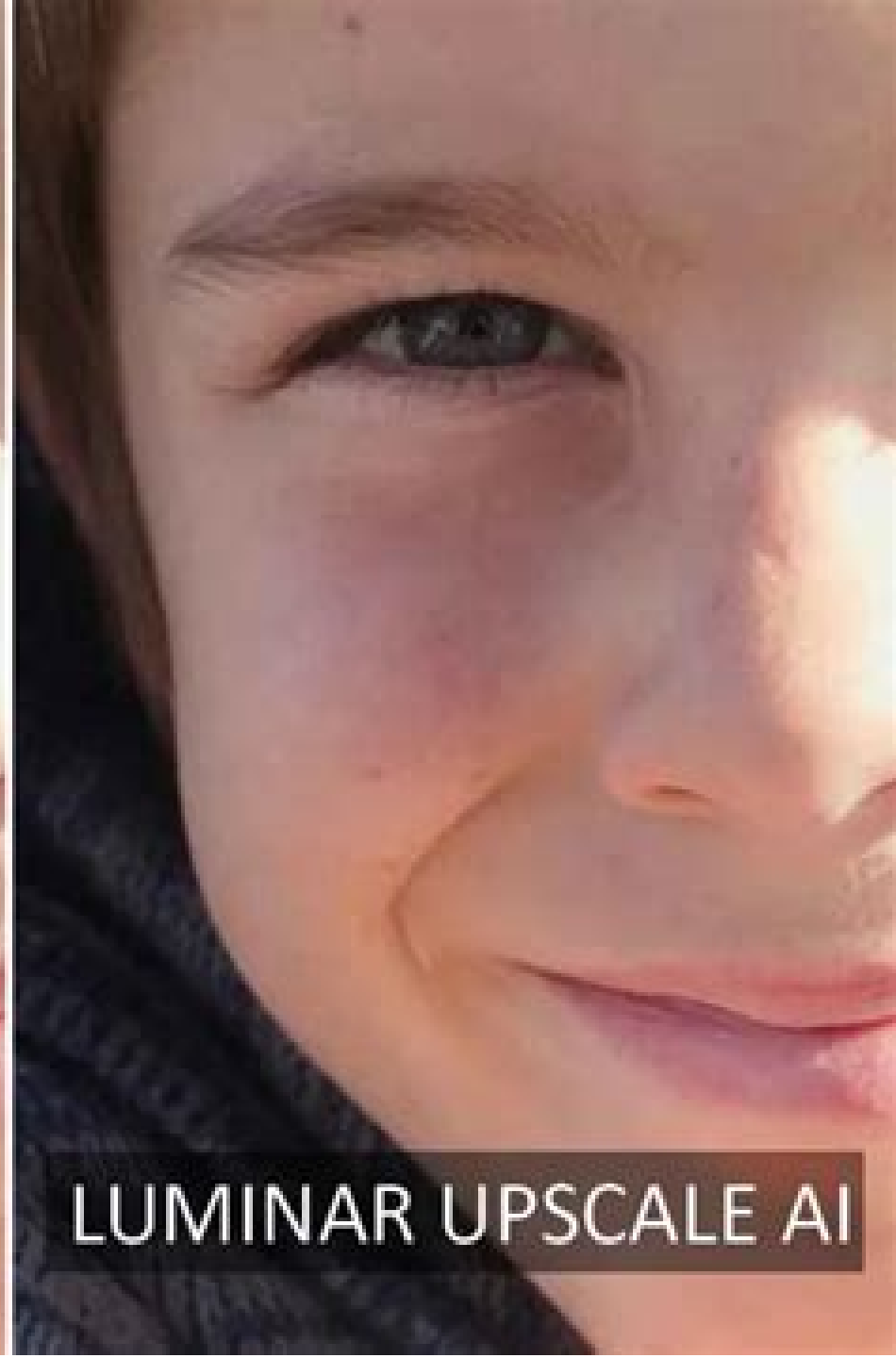
LUMINAR UPSCALE AI