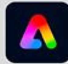
Adobe Express & Firefly