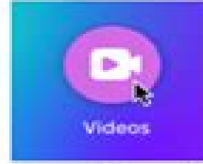
Canva Bkgrnd. Remover