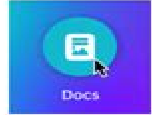
Canva Magic Write