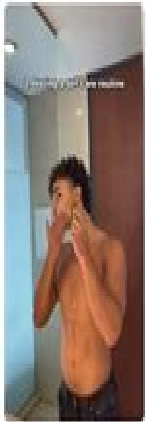
5 Habits to Improve Your Life 6.6M views