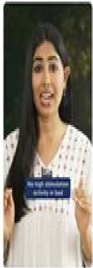
How to Wake Up at 5AM Everyday! Try This One Habit 4.5M views