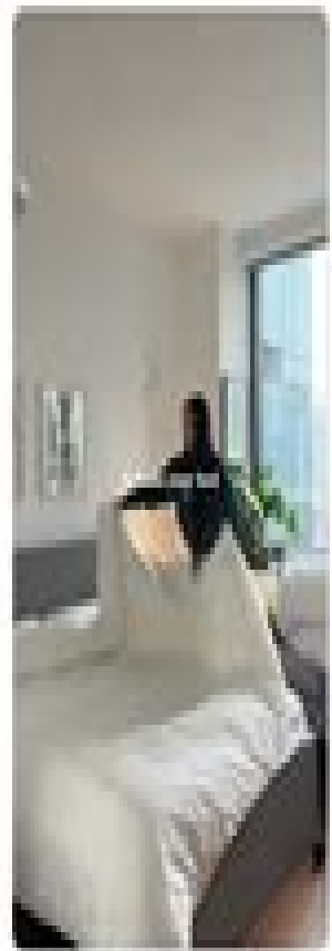
5 healthy habits you need for your morning routine 7M views