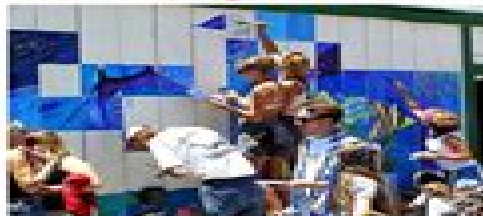
Students gathered to paint the gym wall