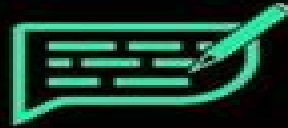
NICHE BLOGGING /- CONTENT AGENCY