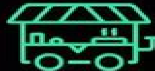
STREET FOOD BUSINESS