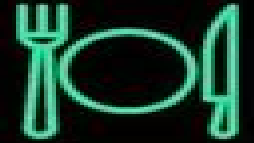
TIFFIN & FOOD SEVICES