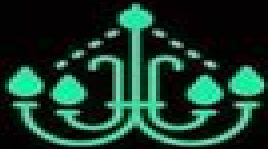
HOME DECOR BUSINESS