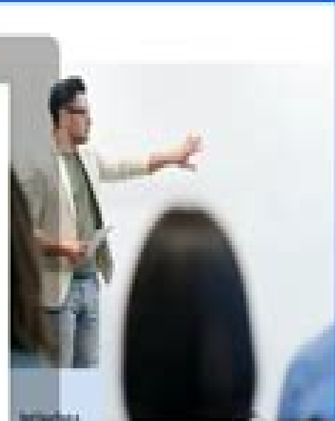
Business and industry leaders attend a careers fair.

Professional formation is the process of gaining the skills and knowledge you need to work in a particular industry. This can be done through formal education or on-the-job training.