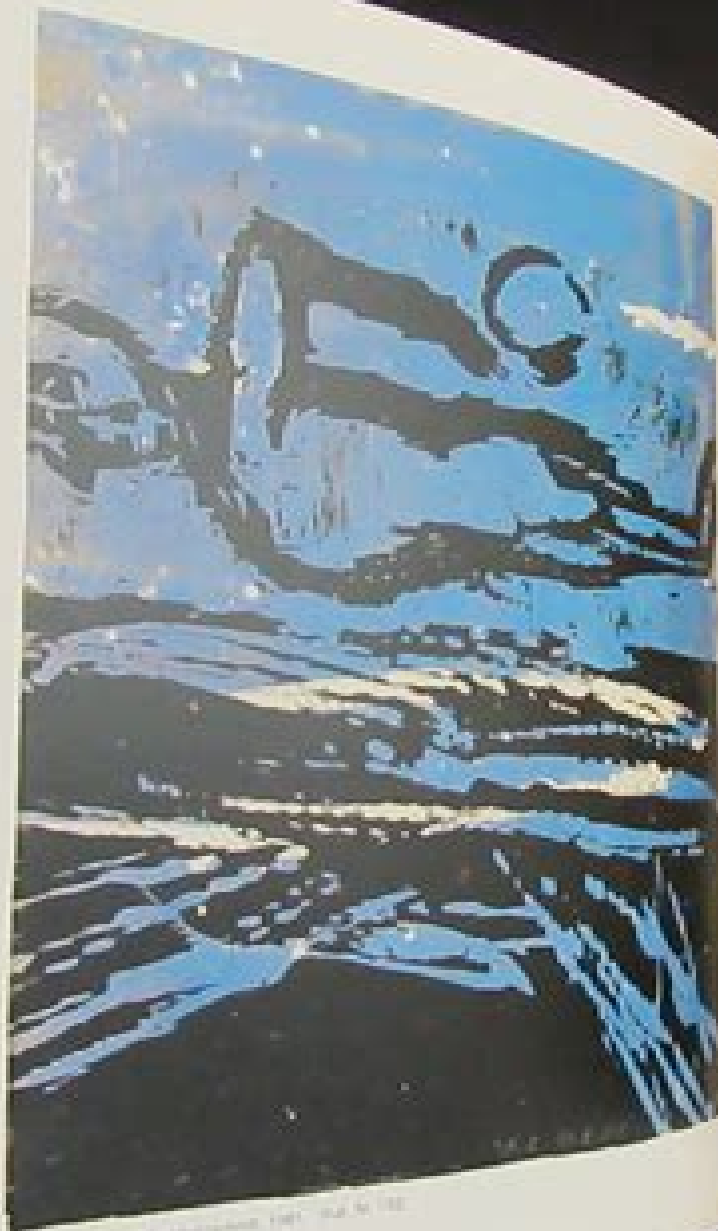
Mein ein Strand, Festschneidung, 1981, Öl auf Holz