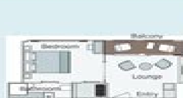
Owner's One-Bedroom Suite 335ft 2 (31.0m 2 )