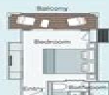
Grand Balcony Suite 210ft 2 (19.5m 2 )