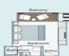
Emerald Panorama Balcony Suite 180ft 2 (16.7m 2 )