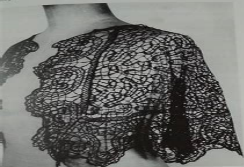
Plate No. 14 Bedfordshire/Maltese cape, 1895-1905 in the collection of The Museum of Costume & Textiles, Nottingham