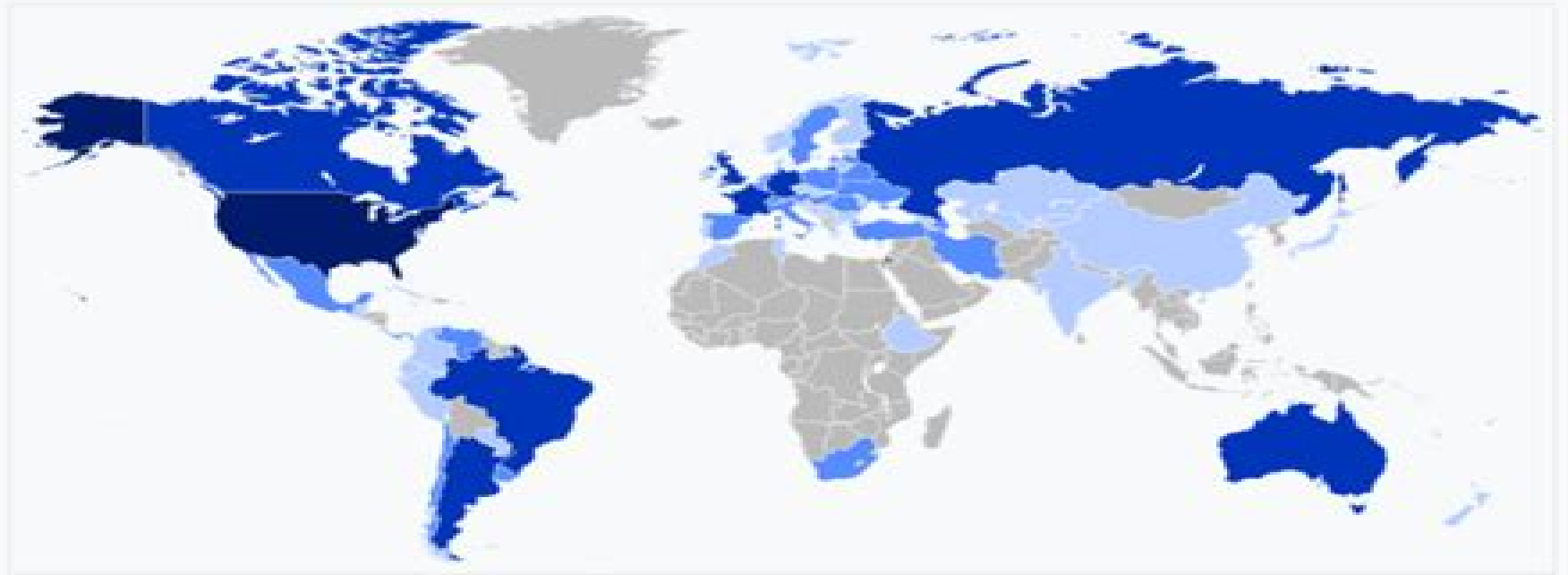
Map of the Jewish diaspora.