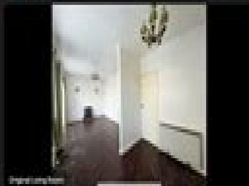
Interior Living Room