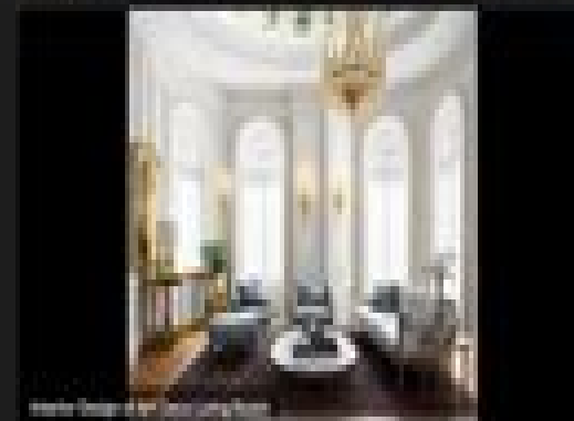
Modern Design of Dining Room Living Room