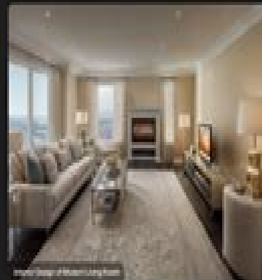
Modern Design of Modern Living Room