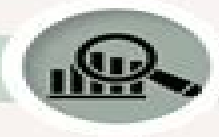
PHOTO EDITING SOFTWARE DEVELOPMENT A Step-by-Step Guide