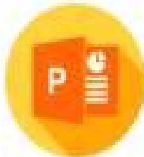
PowerPoint Spkr. Coach