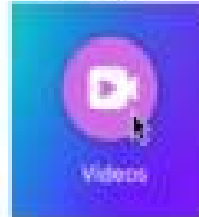
Canva Bkgrnd. Remover