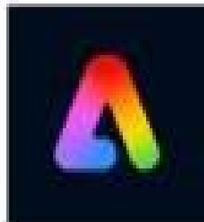
Adobe Bkgrnd. Remove