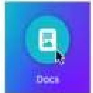
Canva Magic Write