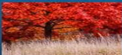
4. NORTHERN RED OAK