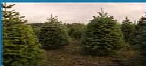
1. DOUGLAS FIR