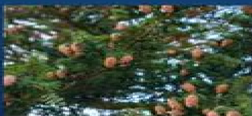
8. EASTERN HEMLOCK