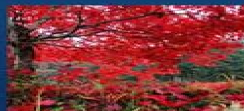
9. RED MAPLE