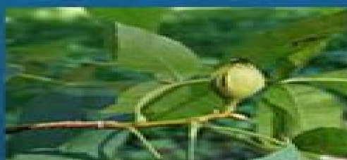
5. BITTERNUT HICKORY