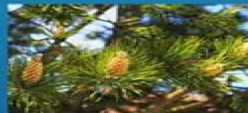
3. EASTERN WHITE PINE