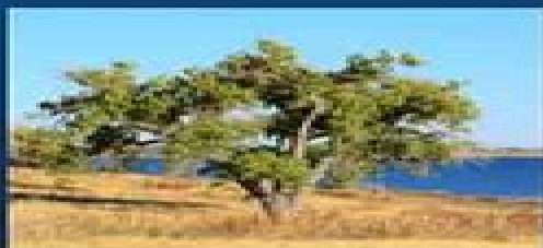
7. EASTERN COTTONWOOD