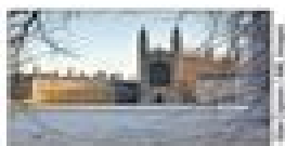
December King's College Chapel, Cambridge

ENVELOPE INCLUDED LARGE LETTER POSTAGE SIZE