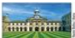
February Emmanuel College