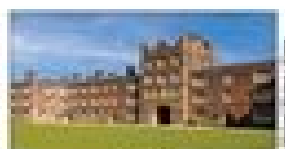
March Jesus College, Cambridge