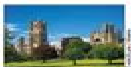
July Ely Cathedral