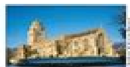
January Church of St Andrew, Sutton-in-the-Iso

Cambridgeshire is a beautiful county that offers great variety, from the huge fields of the Fens to the world-renowned university city of Cambridge. In addition, there are quaint villages and historic market towns. These twelve images, from some of the UK's leading landscape photographers, summarise many of Cambridgeshire's attractions.