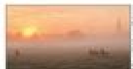
October Saint Ives