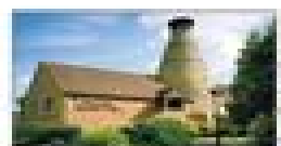
May St Neots