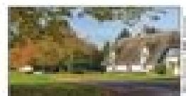
November Barrington Village