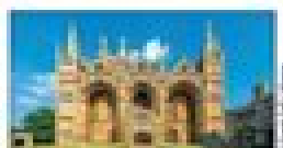
August Peterborough Cathedral