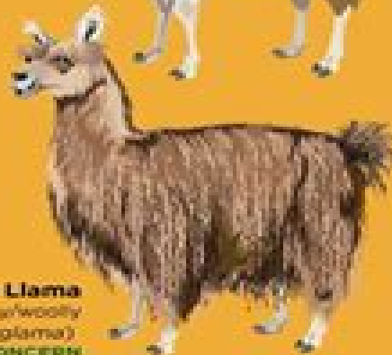
Domesticated Llama Chaku - hairy/wooly ( Lama glama ) LEAST CONCERN