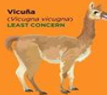
Vicuña ( Vicugna vicugna ) LEAST CONCERN