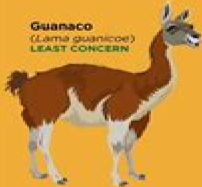
Guanaco ( Lama guanicoe ) LEAST CONCERN