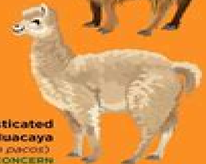
Domesticated Alpaca - Huacaya ( Vicugna pacos ) LEAST CONCERN