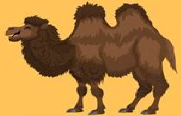
Bactrian Camel (Domesticated) ( Camelus bactrianus ) CRITICALLY ENDANGERED