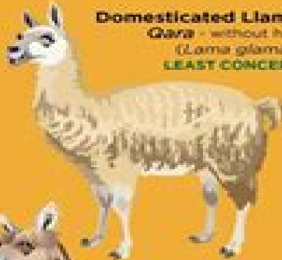
Domesticated Llama Gara - without hair ( Lama glama ) LEAST CONCERN