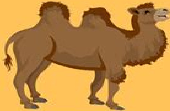
Bactrian Camel (Wild) ( Camelus ferus ) CRITICALLY ENDANGERED