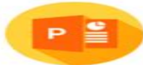
PowerPoint Spkr. Coach