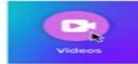
Canva Bkgnd. Remover