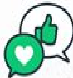
Social media manager