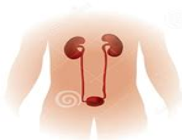
kidney and urinary tract