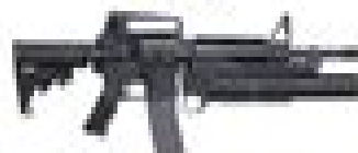
M4 RIFLE WITH 40mm M203 GRENADE LAUNCHER