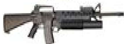
M16A2 RIFLE WITH 40mm M203 GRENADE LAUNCHER