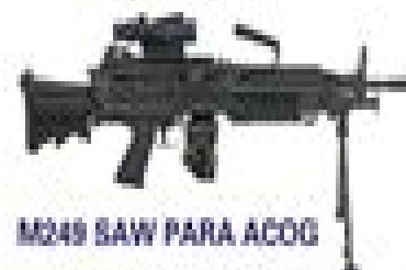
M249 SAW PARA ACOG