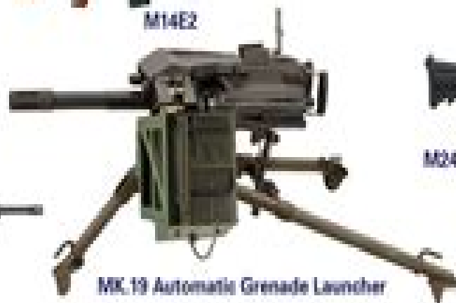
MK.19 Automatic Grenade Launcher