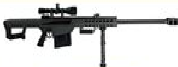
M107 Long Range sniper Rifle