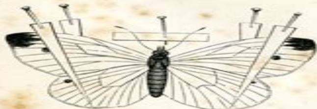
Insect with Double Braces.