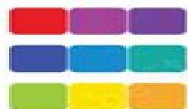
Analogous neighbours on the color wheel