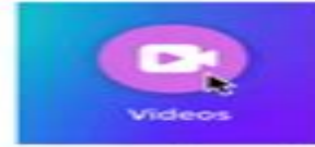
Canva Bkgrnd. Remover