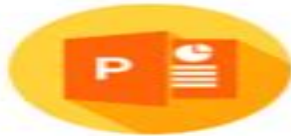
PowerPoint Spkr. Coach