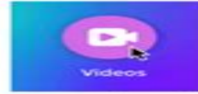
Canva Bkgrnd. Remover