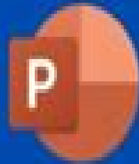
POWERPOINT SPEAKER COACH