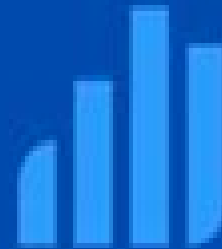
GRADESCOPE – GRADING