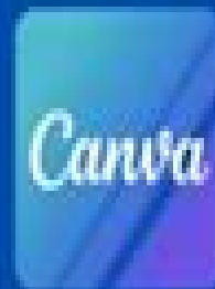
CANVA – GENERATING CONTENT