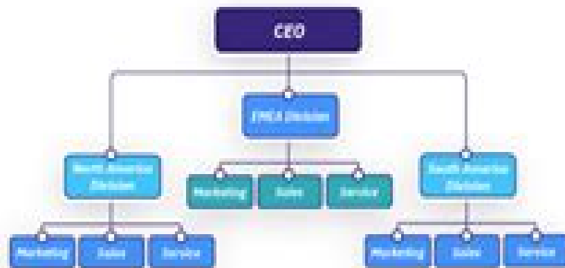
3. Geography-Based Organizational Design