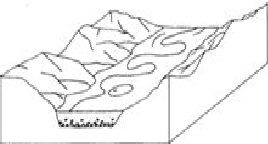
Meandering river region