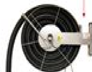
HOSE REEL Easy use Up to 12 m hose EX-approved available