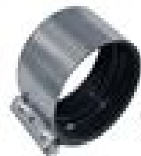
PIPE COUPLING For easy assembly of pipe systems Galvanized or stainless steel