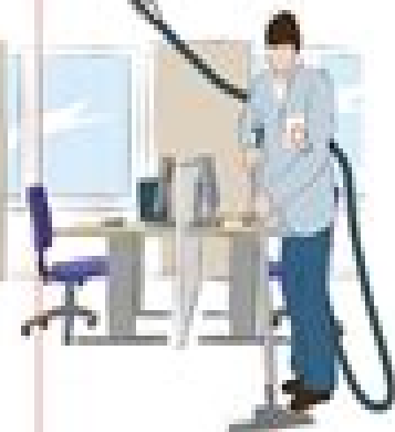
FLOOR CLEANING Cleaning pipes, bends and sturdy floor nozzles