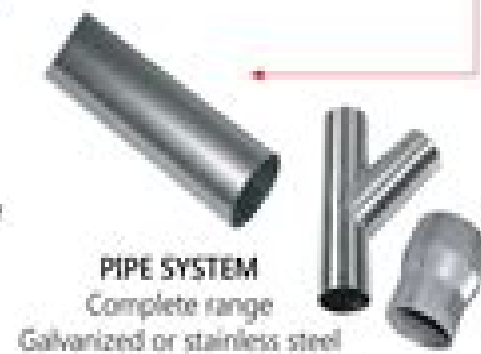
PIPE SYSTEM Complete range Galvanized or stainless steel