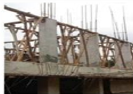
Fig. 4.7 - R. C. C. Column