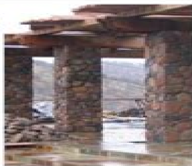
Fig. 4.6 - Masonry Column