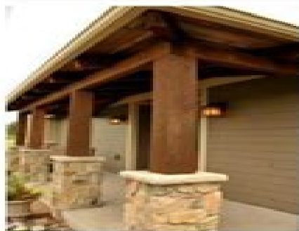
Fig. 4.5 - Timber Column