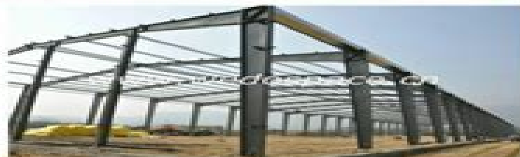
Fig. 4.8 - Steel Column