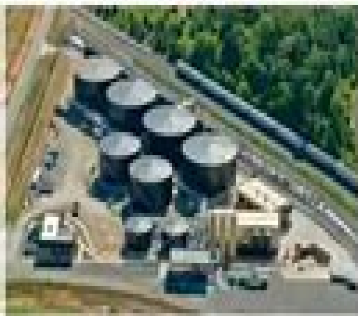
SAMPLE 'A' ASPHALT CEMENT SUPPLIER'S TERMINAL