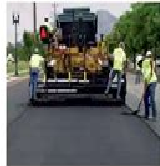
SAMPLE 'D' ASPHALT MIX PAVING SITE