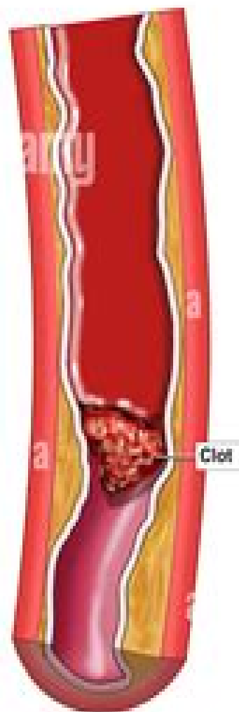
Enlarged section of left anterior descending artery

Subsequent Condition Thrombus lodged within the vessel and completely occluding blood flow.