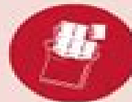
Cramps Around this time, you might even crumble foods like chocolate or other things.