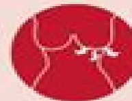
Tender breasts You might feel tenderness around your breasts.