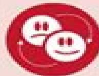
Mood changes Some girls experience mood changes or feel sad before a period starts, this is perfectly normal and is because your hormones are kicking in.