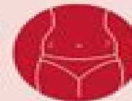
Bloating Your tummy might feel bloated a few days before and during your period - it's perfectly normal.