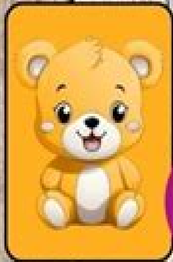
16 Picture Card