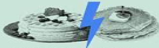
Pancakes vs. Waffles