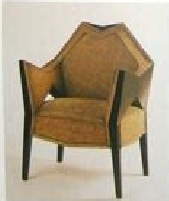
1950 Boudier, 1950 High-backed armchair Backrest and seat upholstered in light-colored fabric Dark wood frame Made in France by Boudier, 1950