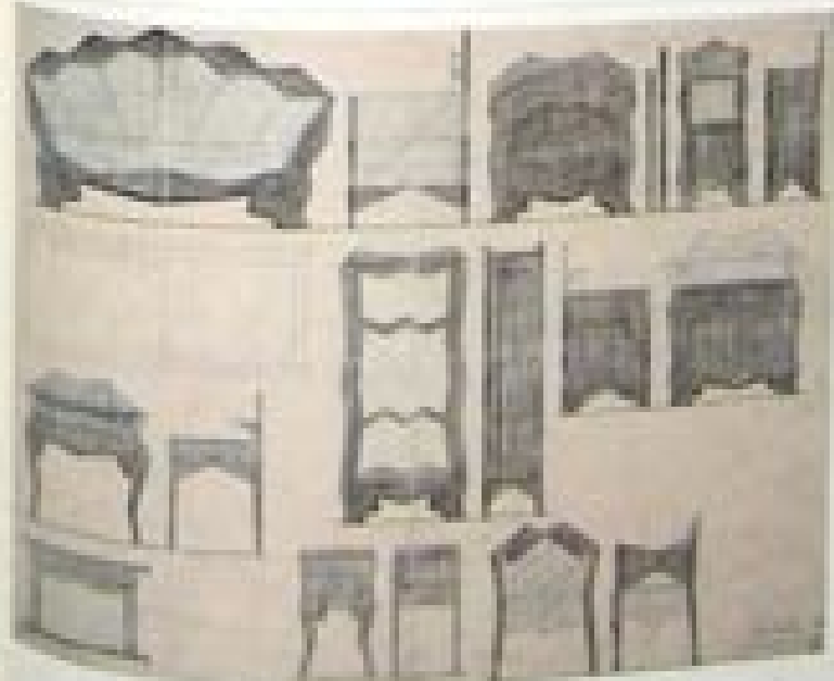
1952 Boudier, 1952 High-backed armchair Backrest and seat upholstered in light-colored fabric Dark wood frame Made in France by Boudier, 1952