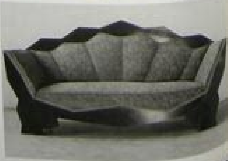
1951 Boudier, 1951 High-backed armchair Backrest and seat upholstered in light-colored fabric Dark wood frame Made in France by Boudier, 1951