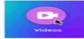
Canva Bkgnd. Remover