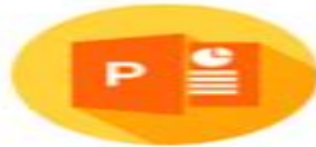
PowerPoint Spkr. Coach