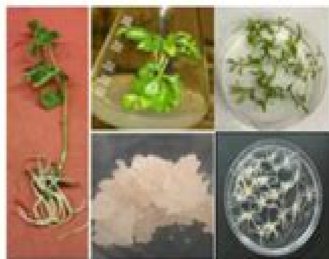
Stage 4.2. Post-LN. Regrowth (regeneration)