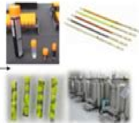
Container, cooling & storage