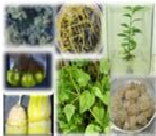
Stage 1. Material selection and preparation