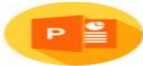
PowerPoint Spkr. Coach